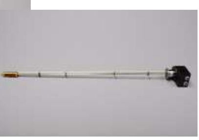
High Voltage Cryogenic Probe (HVCP) compatible with Quantum Design PPMS