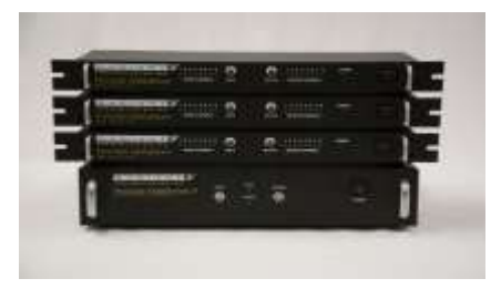
Precision Radiant Tester with Multiplexer

The MUX 2018 is its own stand-alone USB controlled instrument and can test hot or cold temperatures.