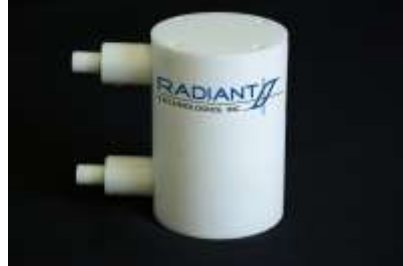
High Voltage High Temperature Test Fixture

Radiant offers several test fixtures that range from 230°C to 650°C rated to 10kV. These test fixtures can be used at room temperature, with silicon oil, or in a chamber or furnace.